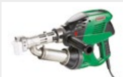
Leister Weldplast S2

Call a member of our team or visit a branch to discuss your requirements