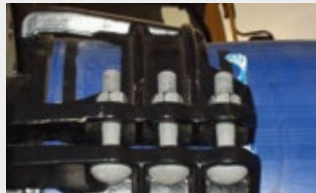
Heat Mat Kits

Call a member of our team or visit a branch to discuss your requirements