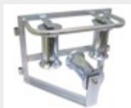
Guide Corner Roller

MCA can accommodate all of your equipment needs for electrical and telecoms installation and repair.