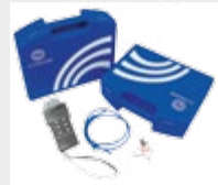
Comark Pressure Meters