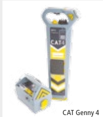
CAT Genny 4