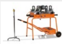
Prisma 125 Socket Fusion Machine