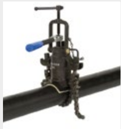
Flow Stopping Drill

Call a member of our team or visit a branch to discuss your requirements