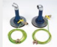
Torando Barhole Evacuation Tools