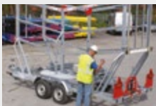
Cable Drum Trailors