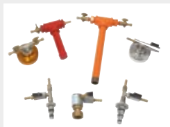
Mains Test Cowhorns

MCA offer a range of Testing Equipment suitable for professionals within the gas and water utilities industries.