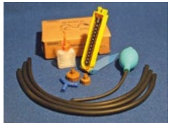
Pressure Testing Kit

* Available in Red, Blue, Green, Purple, Yellow and Orange. A 200g jar will trace up to 15,000 litres in chemical free water.